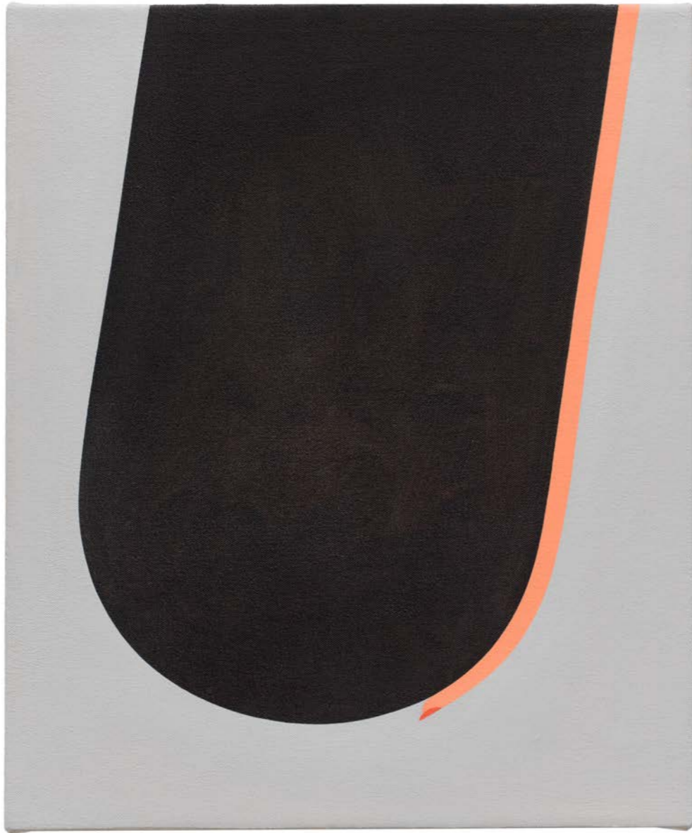
Alice Tippit Idle oil on canvas 18 x 14 inches