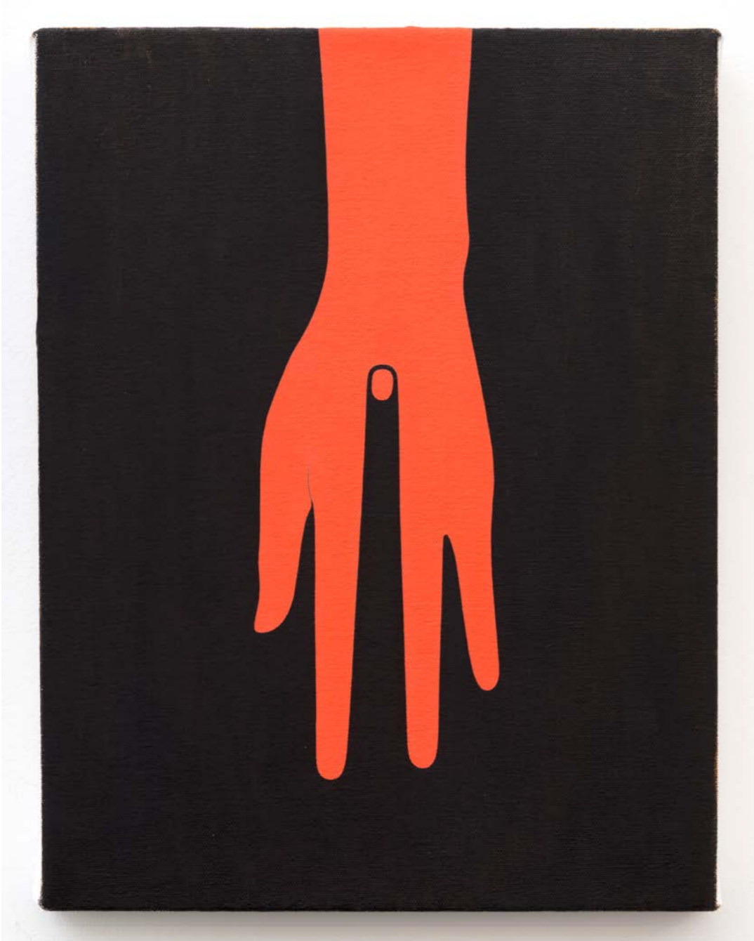
Alice Tippit Mass oil on canvas 13 x 10 inches