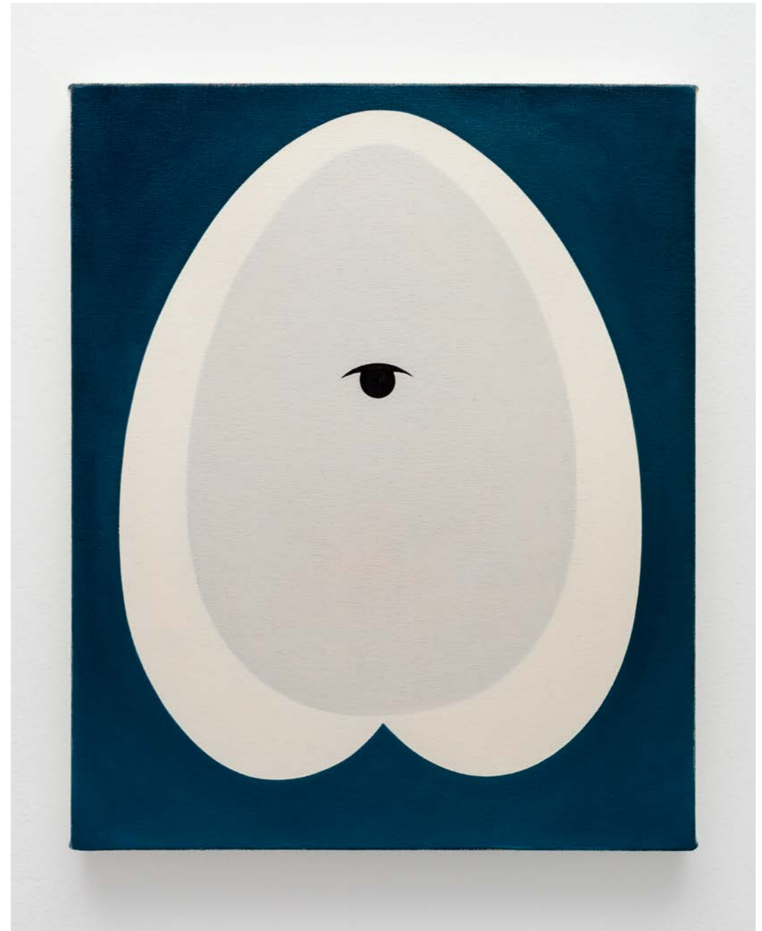
Alice Tippit Monitor oil on canvas 16 x 13 inches