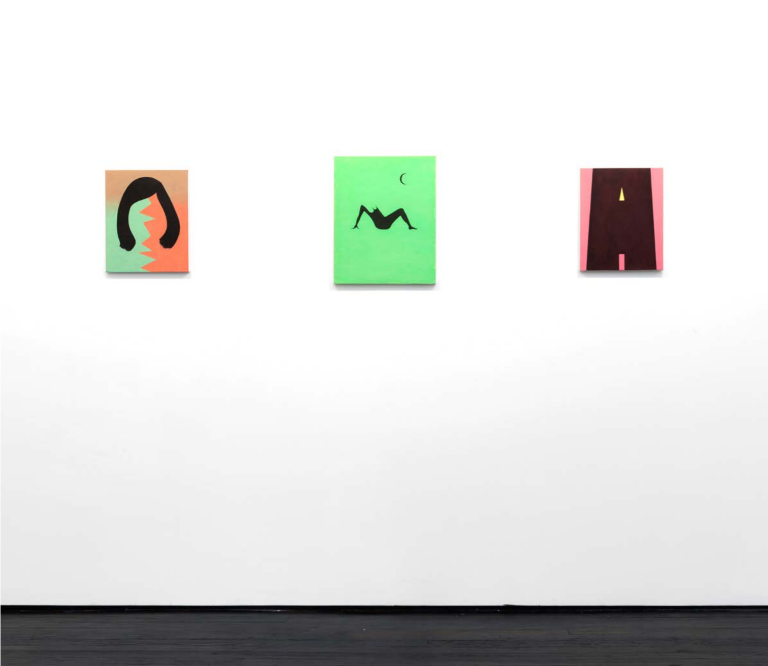
Alice Tippit ESSENVY Installation view Nicelle Beauchene Gallery