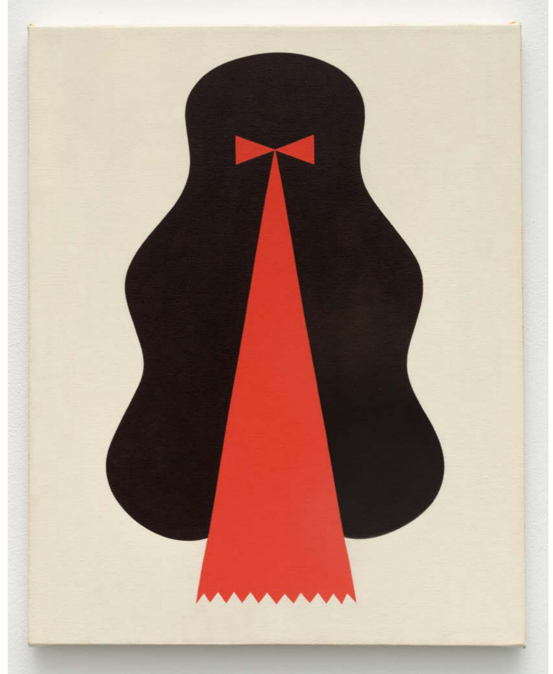
Alice Tippit Short oil on canvas 20 x 16 inches