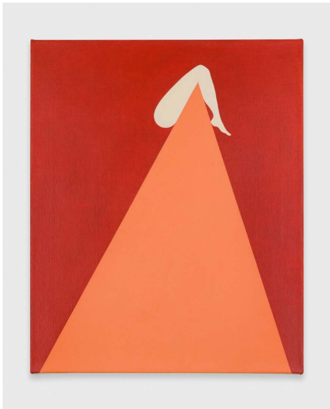
Alice Tippet Skirt oil on canvas 22 x 18 inches