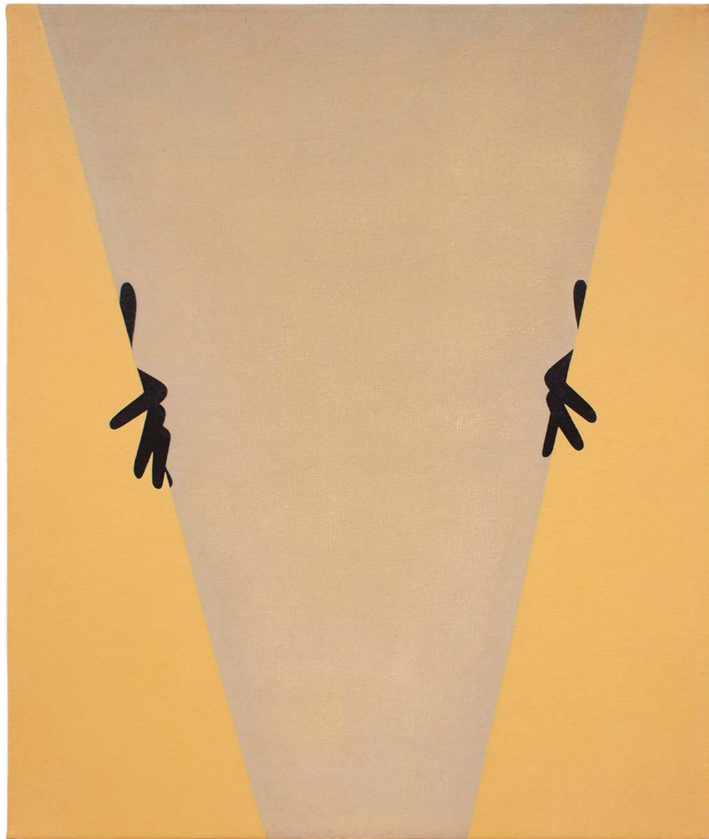
Featured image (p.18):

Alice Tippit Vérse oil on canvas 19 x 16 inches