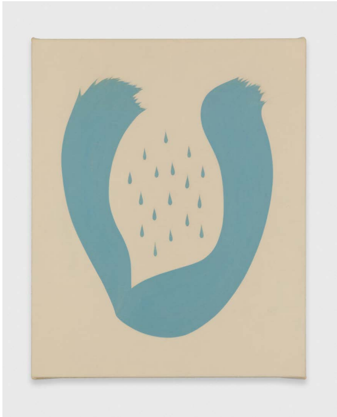
Alice Tippet Toll oil on canvas 16 x 13 inches