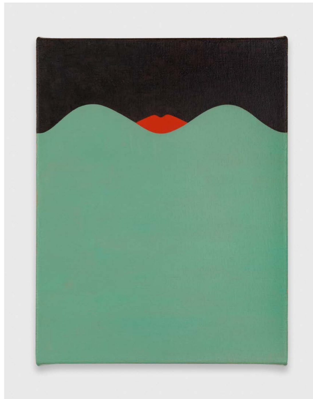
Alice Tippet Bell oil on canvas 13 x 10 inches