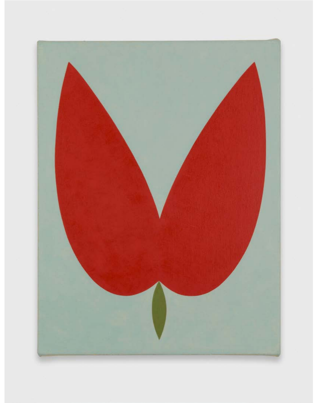
Alice Tippit Sore oil on canvas 13 x 10 inches