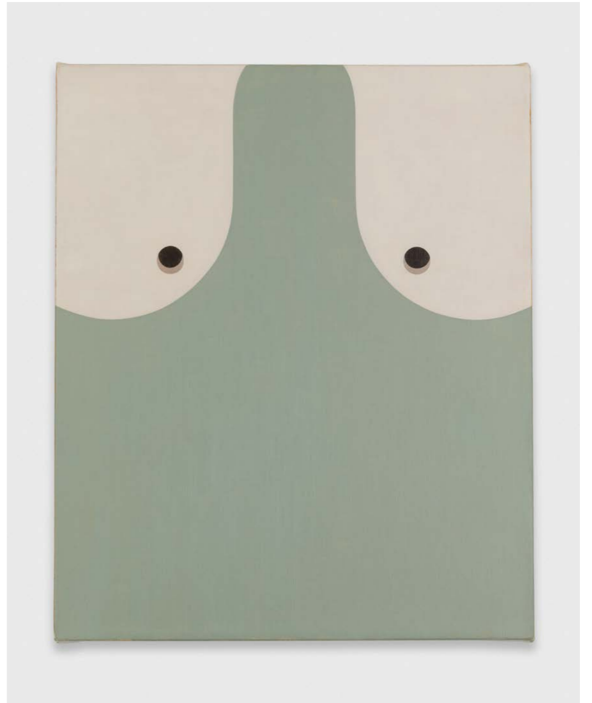
Alice Tippet Loose oil on canvas 19 x 16 inches