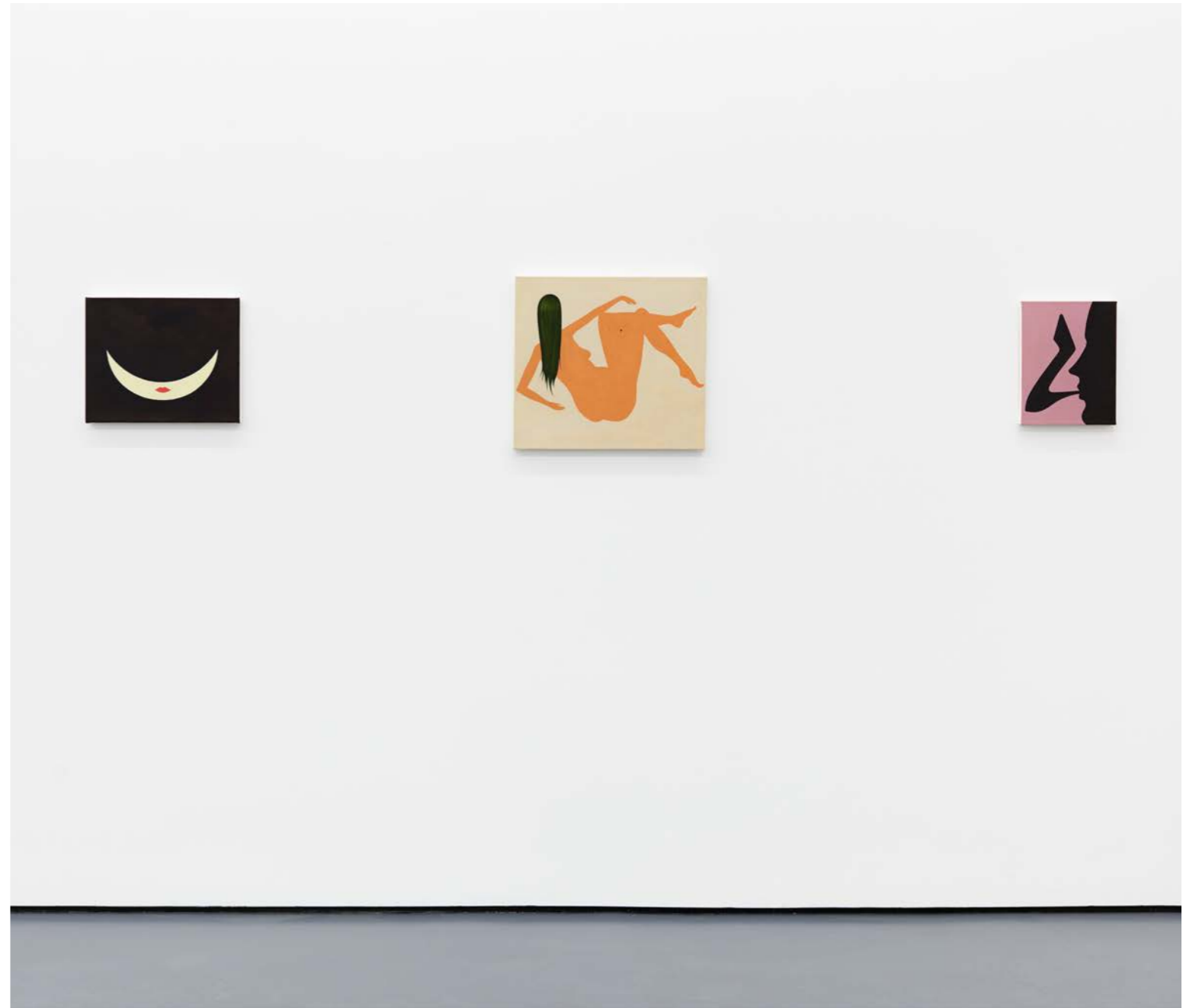
Alice Tippit Woman on Yellow Motorcycle in Crystal Lake Installation View Kimmerich Galerie